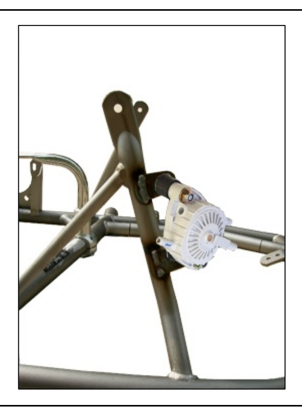
Photo of the frame with the section of the support for the fuel pump (fuel pump mounted)

Photo from above of the frame with the section of the two supports for the exhaust system