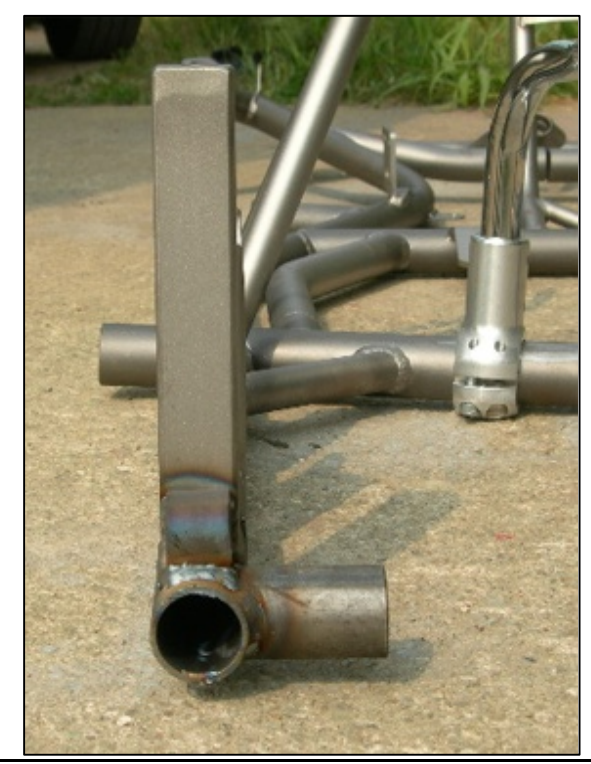
Photo of the frame from the back with the section of the support for the RTPS (Rear Tire Protection System)

Photo of the frame from the side with the section of the support for the RTPS (Rear Tire Protection System)