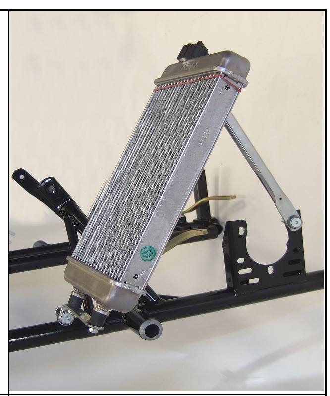
Photo of the frame from the side with the section of the supports for the radiator (radiator mounted)