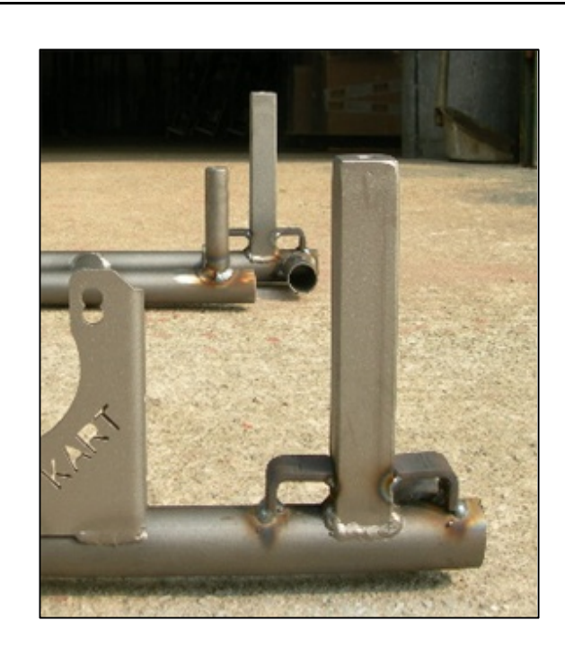
Photo of the frame from the side with the section of the support for the RTPS (Rear Tire Protection System)

Photo from above of the frame with the section of the two supports for the RTPS (Rear Tire Protection System)