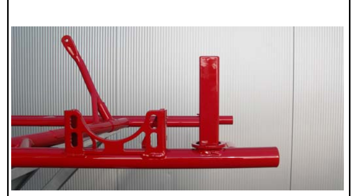
Photo from the steering column with the section with the Photo from above of the frame with the section of the two supports for the RTPS (Rear Tire Protection System)

knurling for the steering wheel hub (knurling according to DIN 82 - RAA1).