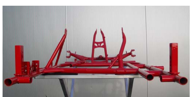
Photo of the frame from the side with the section of the support for the RTPS