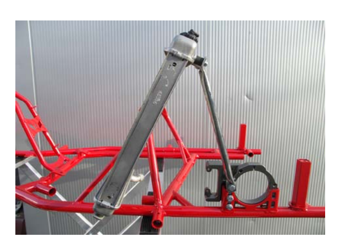
Foto of the frame with the section of the support for the fuel pump (fuel pump mounted)

Foto of the frame from the side with the section of the supports for the radiator (radiator mounted)