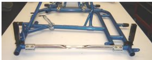
Photo from above of the frame with the section of the two supports for the RTPS (Rear Tire Protection System)

Photo from the steering column with the section with the knurling for the steering wheel hub (knurling according to DIN 82 - RAA1).