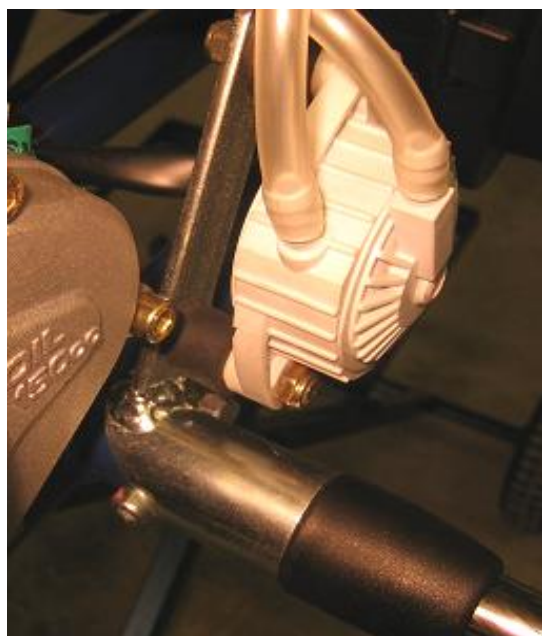
Photo of the frame with the section of the support for the fuel pump (fuel pump mounted)