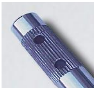
Photo from the steering column with the section with the knurling for the steering wheel hub (knurling according to DIN 82 - RAA1).