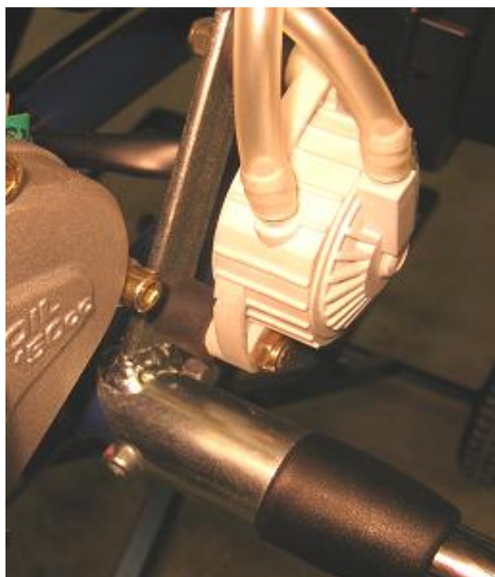
Photo of the frame with the section of the support for the fuel pump (fuel pump mounted)