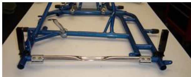
Photo from above of the frame with the section of the two supports for the RTPS (Rear Tire Protection System)

Photo from the steering column with the section with the knurling for the steering wheel hub (knurling according to DIN 82 - RAA1).