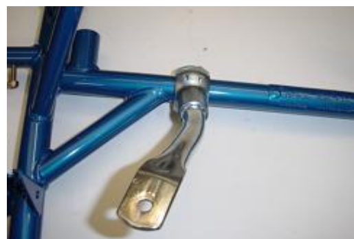
Photo from above of the frame with the section of the two supports for the exhaust system