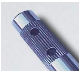
Photo from the steering column with the section with the knurling for the steering wheel hub (knurling according to DIN 82 - RAA1).