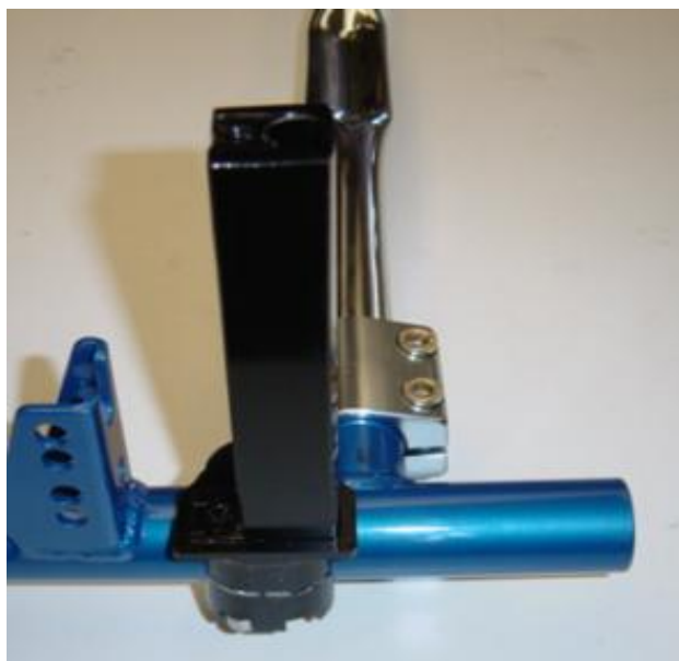
Photo of the frame from the side with the section of the support for the RTPS (Rear Tire Protection System)

Photo from above of the frame with the section of the two supports for the RTPS (Rear Tire Protection System)