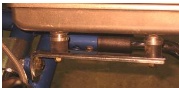
Photo of the frame from the side with the section of the supports for the radiator (radiator mounted)