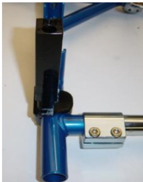
Photo of the frame from the back with the section of the support for the RTPS (Rear Tire Protection System)

Photo of the frame from the side with the section of the support for the RTPS (Rear Tire Protection System)