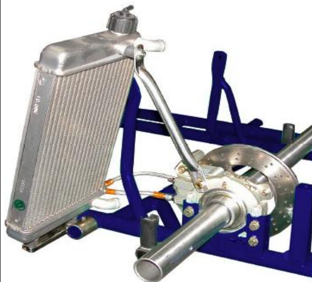
Photo of the frame from the side with the section of the supports for the radiator (radiator mounted)