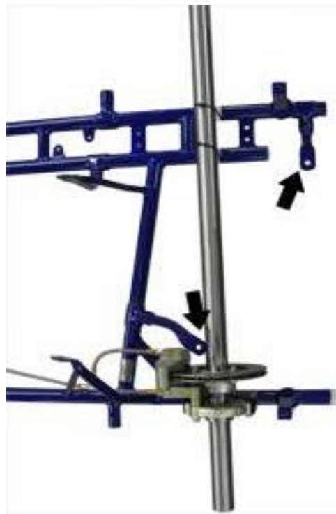
Photo from above of the frame with the section of the two supports for the exhaust system