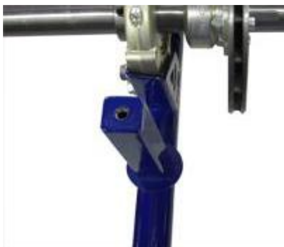
Photo of the frame from the side with the section of the support for the RTPS (Rear Tire Protection System)