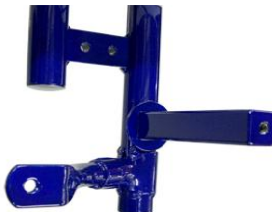
Photo of the frame from the back with the section of the support for the RTPS (Rear Tire Protection System)