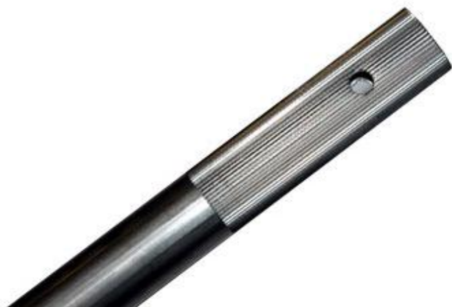
Photo from the steering column with the section with the knurling for the steering wheel hub (knurling according to DIN 82 - RAA1).