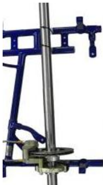
Photo from above of the frame with the section of the two supports for the RTPS (Rear Tire Protection System)