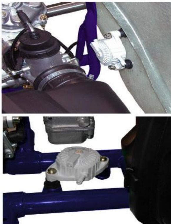
Photo of the frame with the section of the support for the fuel pump (fuel pump mounted)