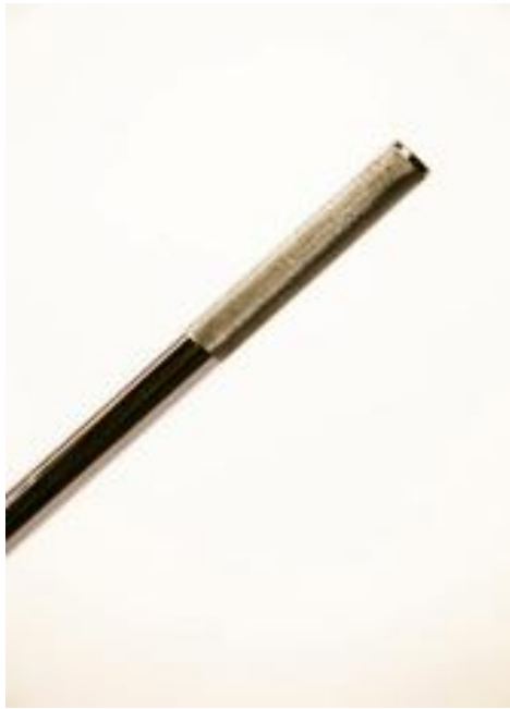
Photo from the steering column with the section with the knurling for the steering wheel hub (knurling according to DIN 82 - RAA1).