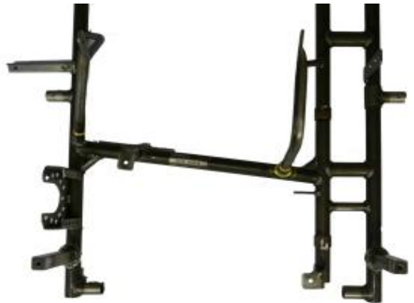
Photo from above of the frame with the section of the two supports for the RTPS (Rear Tire Protection System)