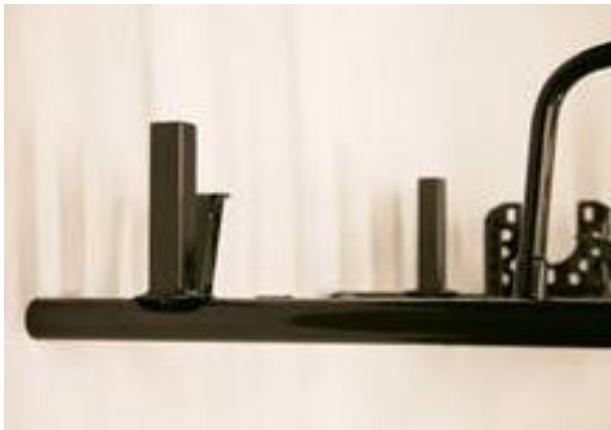
Photo of the frame from the side with the section of the support for the RTPS (Rear Tire Protection System)