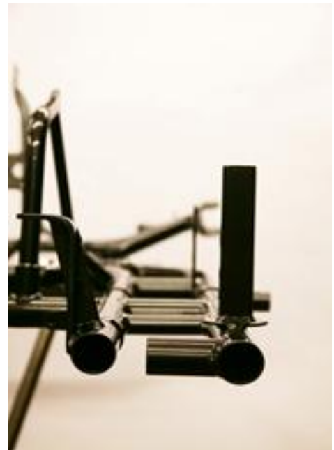
Photo of the frame from the back with the section of the support for the RTPS (Rear Tire Protection System)