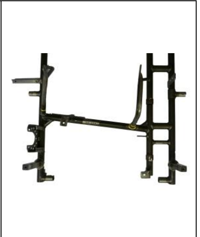
Photo from above of the frame with the section of the two supports for the exhaust system