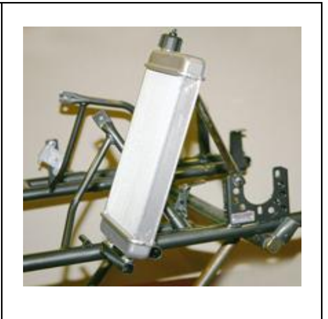
Foto of the frame from the side with the section of the supports for the radiator (radiator mounted)