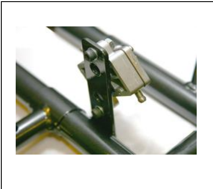
Foto of the frame with the section of the support for the fuel pump (fuel pump mounted)