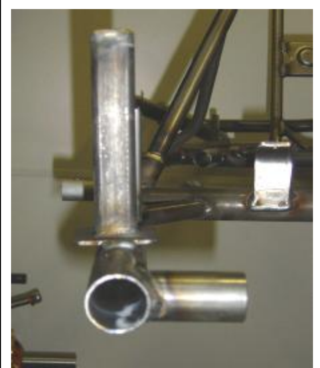
Photo of the frame from the back with the section of the support for the RTPS (Rear Tire Protection System)