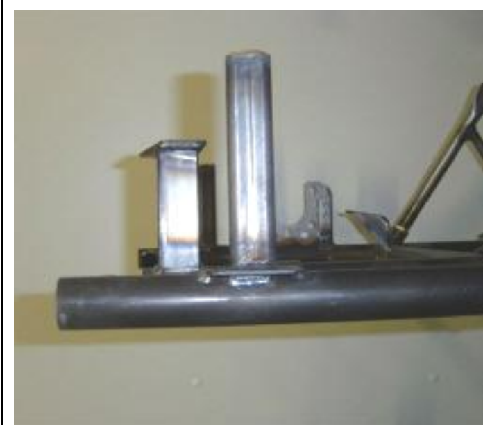
Photo of the frame from the side with the section of the support for the RTPS (Rear Tire Protection System)