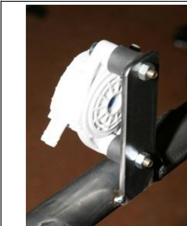
Photo of the frame with the section of the support for the fuel pump (fuel pump mounted)