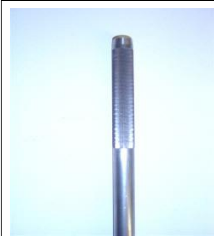
Photo from the steering column with the section with the knurling for the steering wheel hub (knurling according to DIN 82 - RAA1).