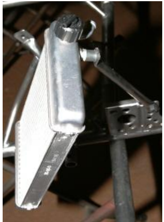
Photo of the frame from the side with the section of the supports for the radiator (radiator mounted)