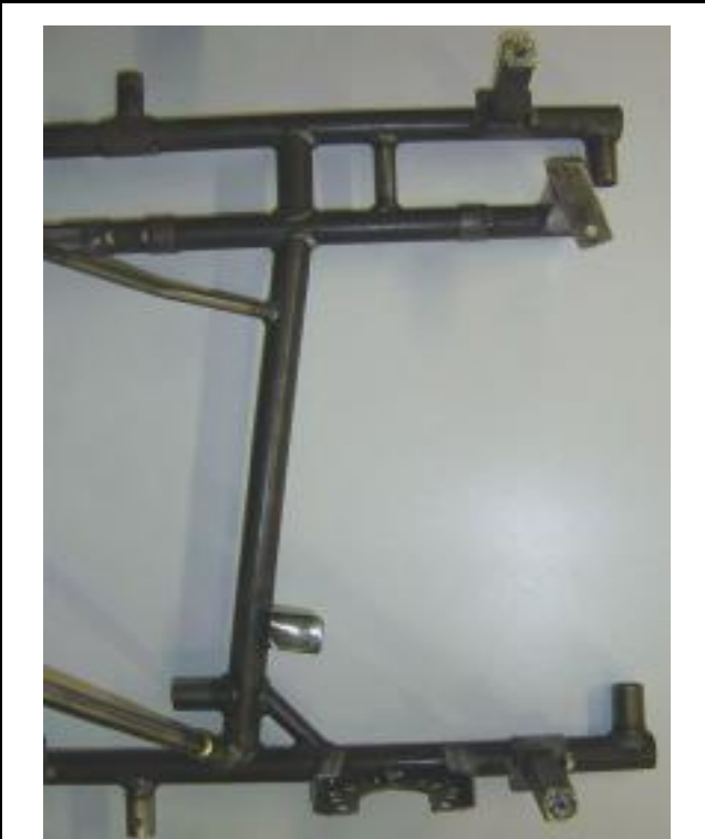
Photo from above of the frame with the section of the two supports for the RTPS (Rear Tire Protection System)