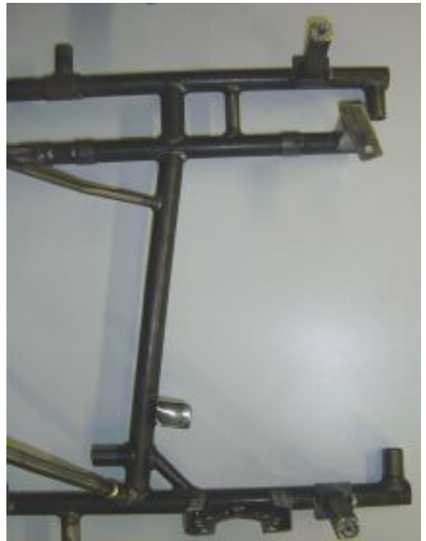
Photo from above of the frame with the section of the two supports for the exhaust system