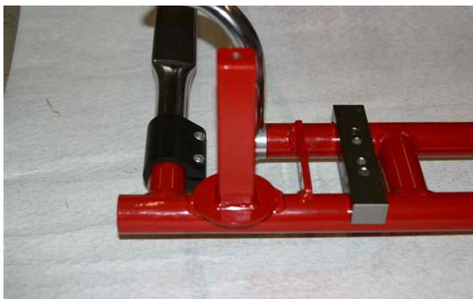
Photo of the frame from the side with the section of the support for the RTPS (Rear Tire Protection System)