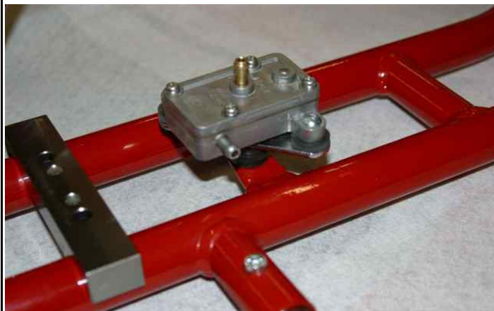
Foto of the frame with the section of the support for the fuel pump (fuel pump mounted)