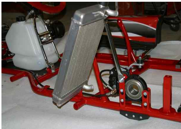
Foto of the frame from the side with the section of the supports for the radiator (radiator mounted)