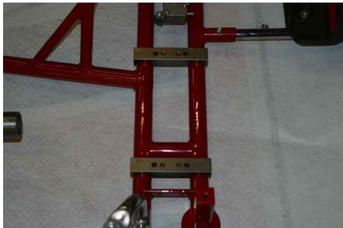
Photo from above of the frame with the section of the engine mount