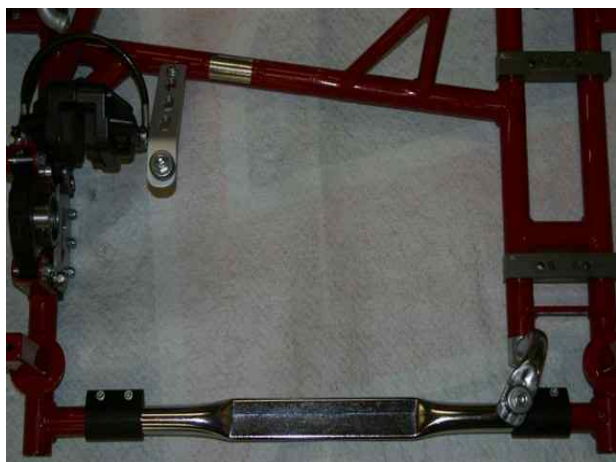
Photo from above of the frame with the section of the two supports for the exhaust system