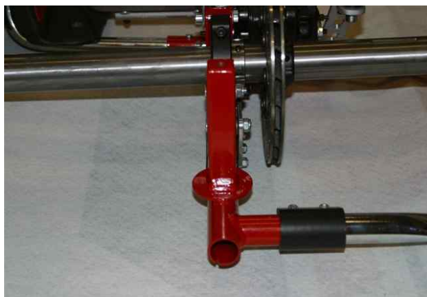
Photo of the frame from the back with the section of the support for the RTPS (Rear Tire Protection System)