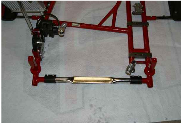
Photo from above of the frame with the section of the two supports for the RTPS (Rear Tire Protection System)