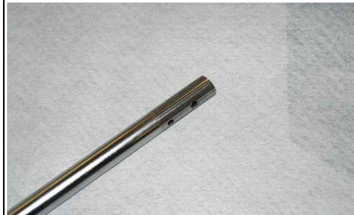
Photo from the steering column with the section with the knurling for the steering wheel hub (knurling according to DIN 82 - RAA1).